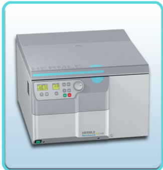
Z446 Universal Centrifuge